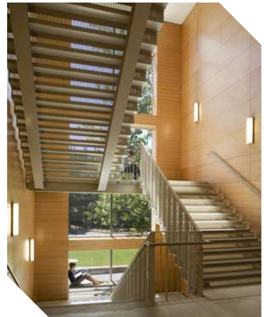
Studying at the Sciences Laboratory Building